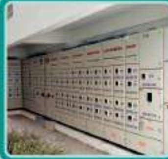
LT METERING PANELS